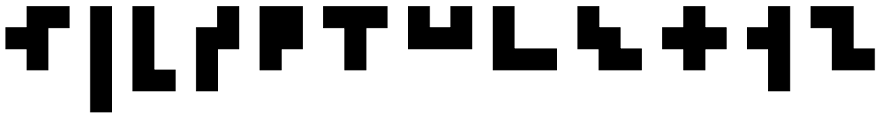
Figure 2: All 12 possible pentominoes.

A pentomino is a shape made from five squares glued together. There are 12 of these shapes: