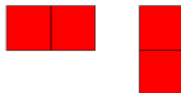
Figure 3: A Domino in its horizontal and vertical orientations.